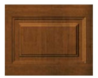
Classic Medium Finish

Due to the printing process, colors may vary. Not available on Models 4050 or 4053.